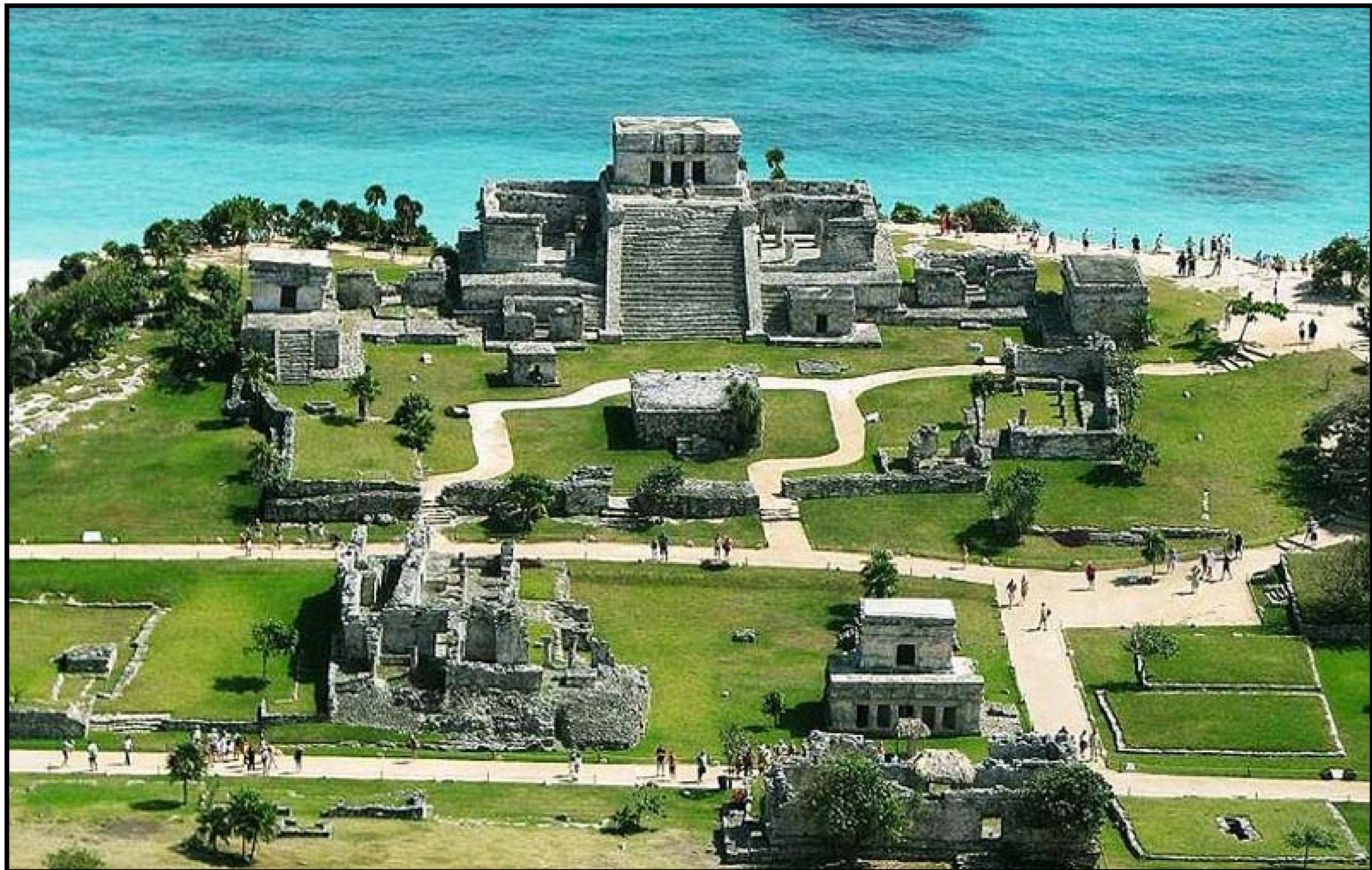
Tulum Mayan Ruins