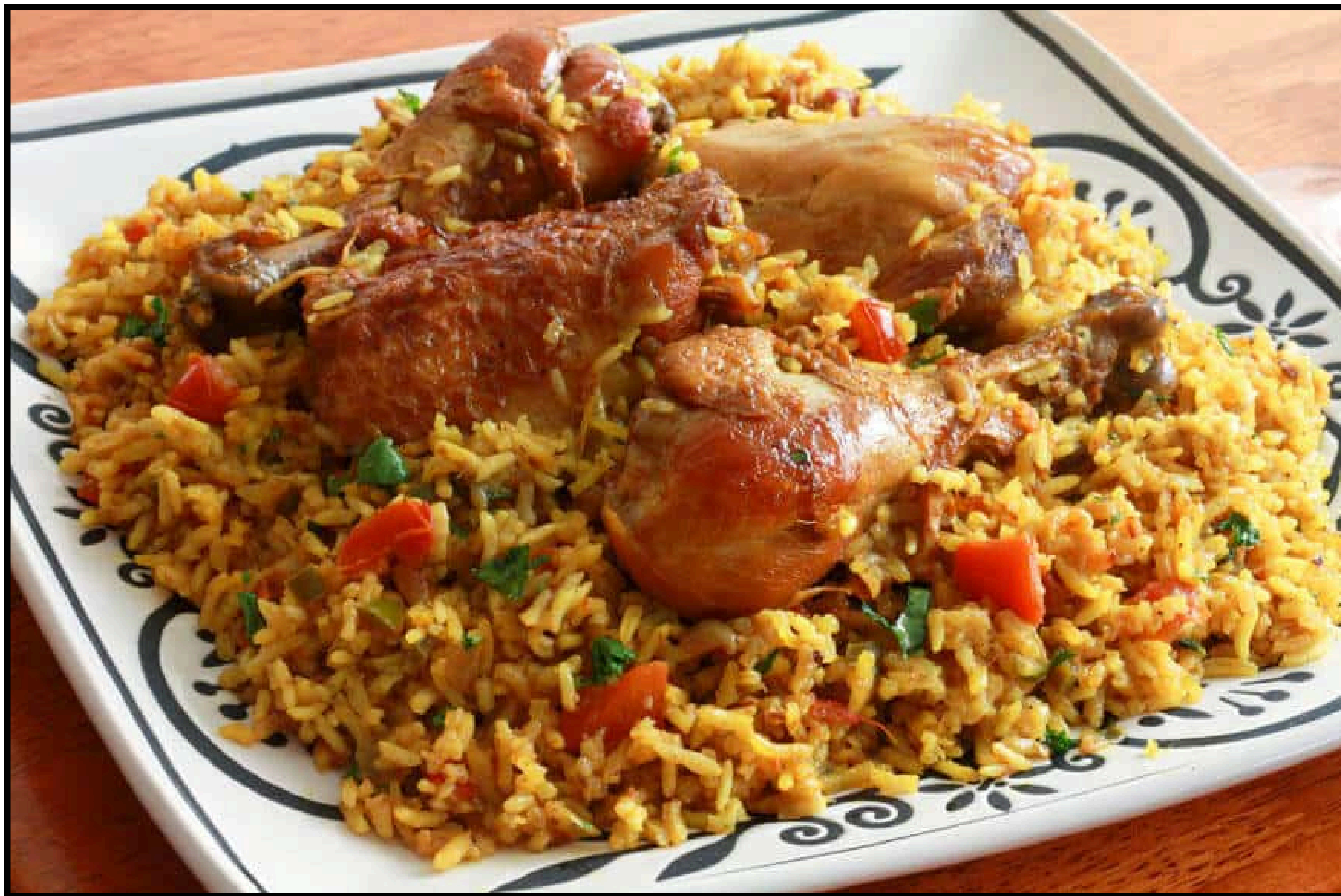
Chicken Machboos (Bahraini Spiced Chicken and Rice)