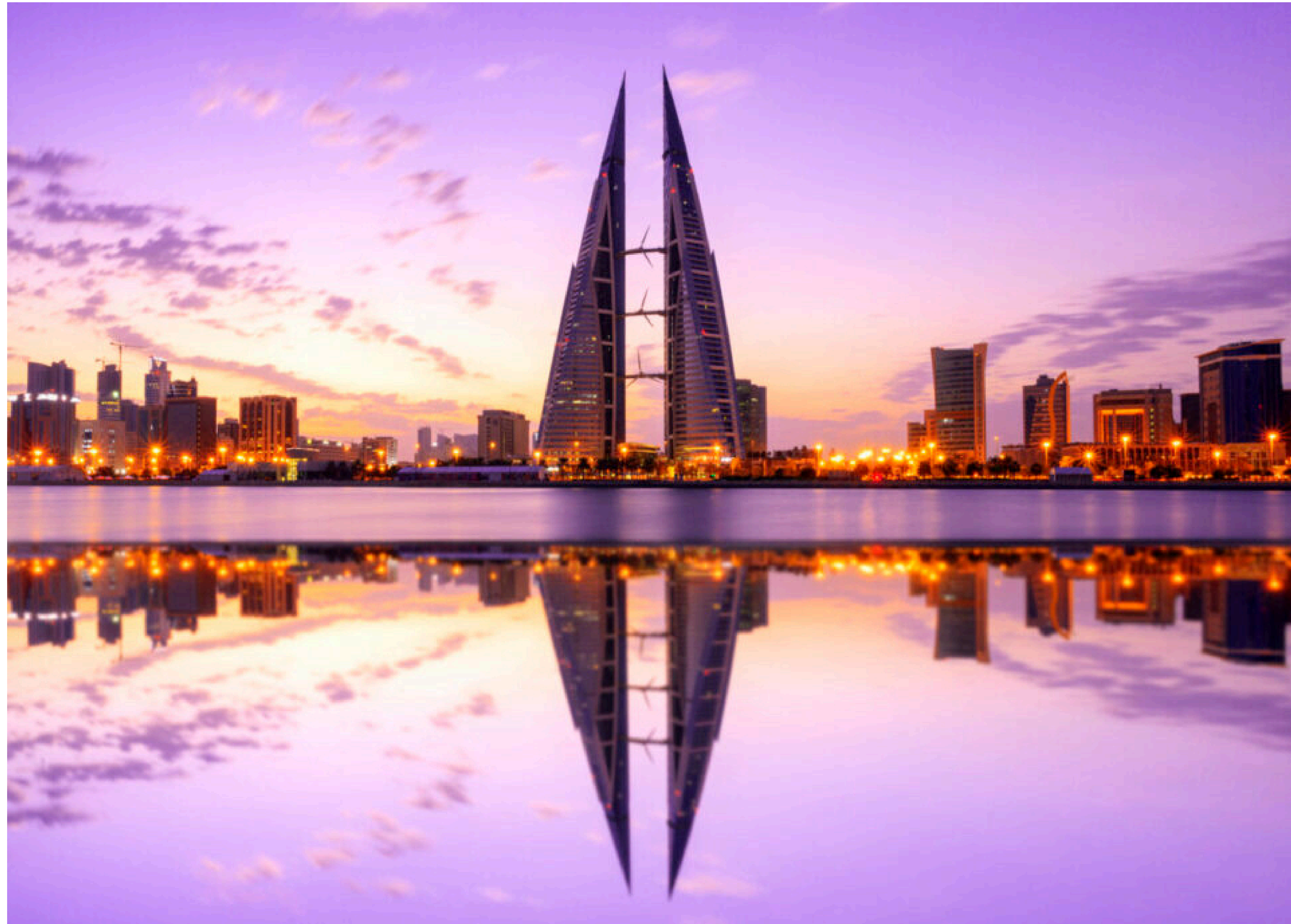
Bahrain World Trade Center