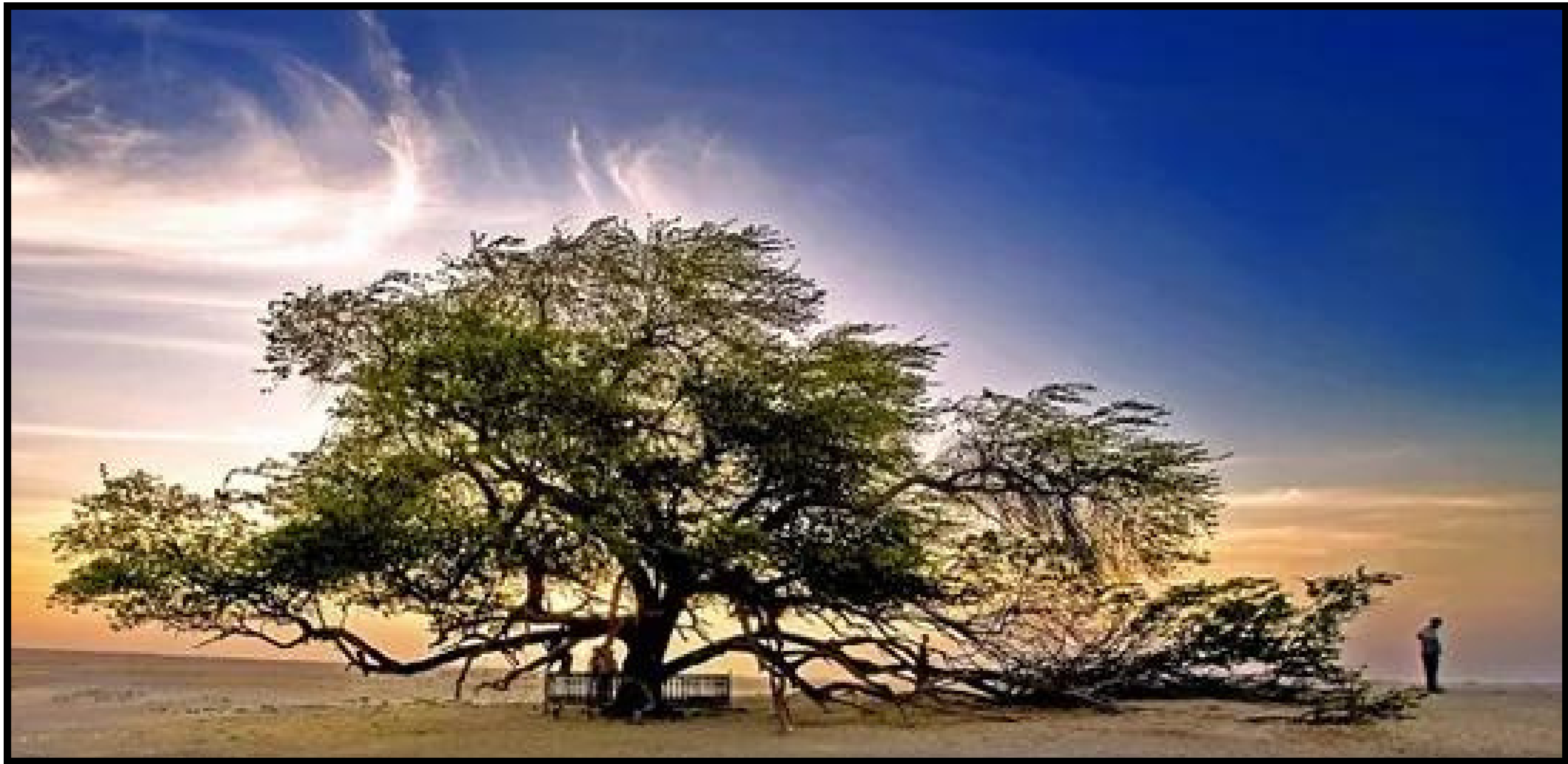
Tree of Life