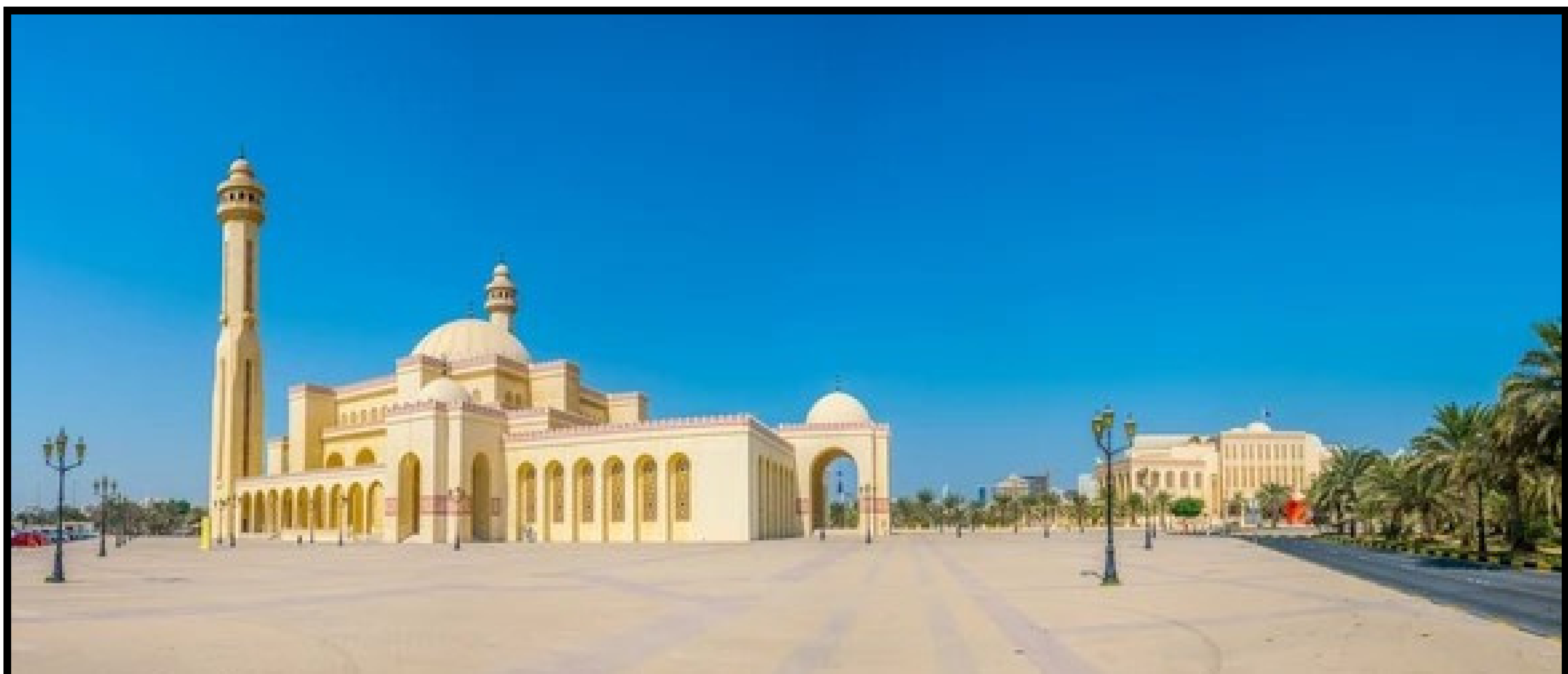
Al Fateh Grand Mosque