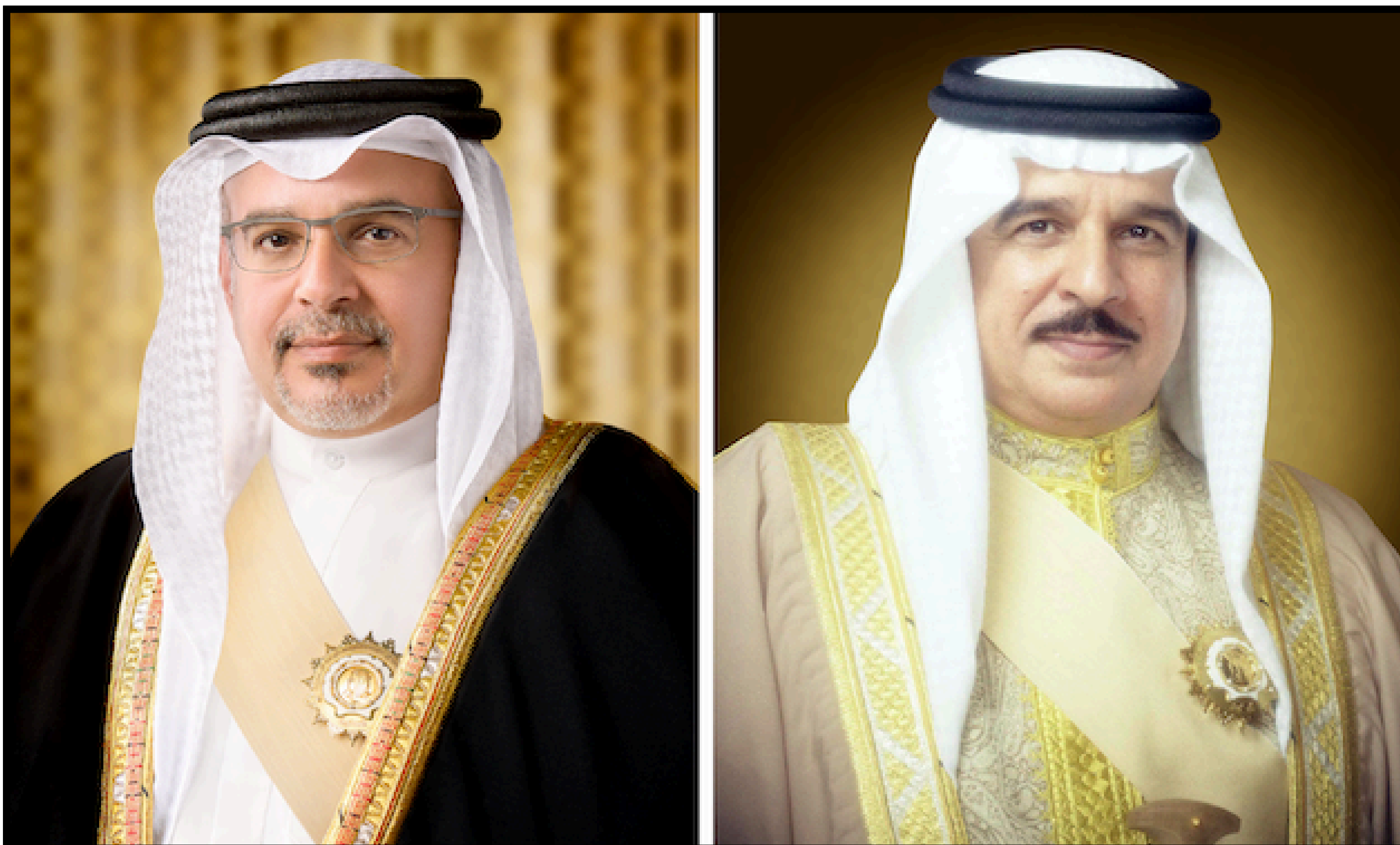
His Majesty King Hamad bin Isa Al Khalifa and His Royal Highness Prince Salman bin Hamad Al Khalifa