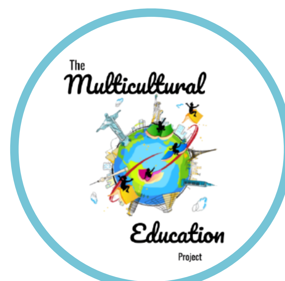
The Multicultural Education Project