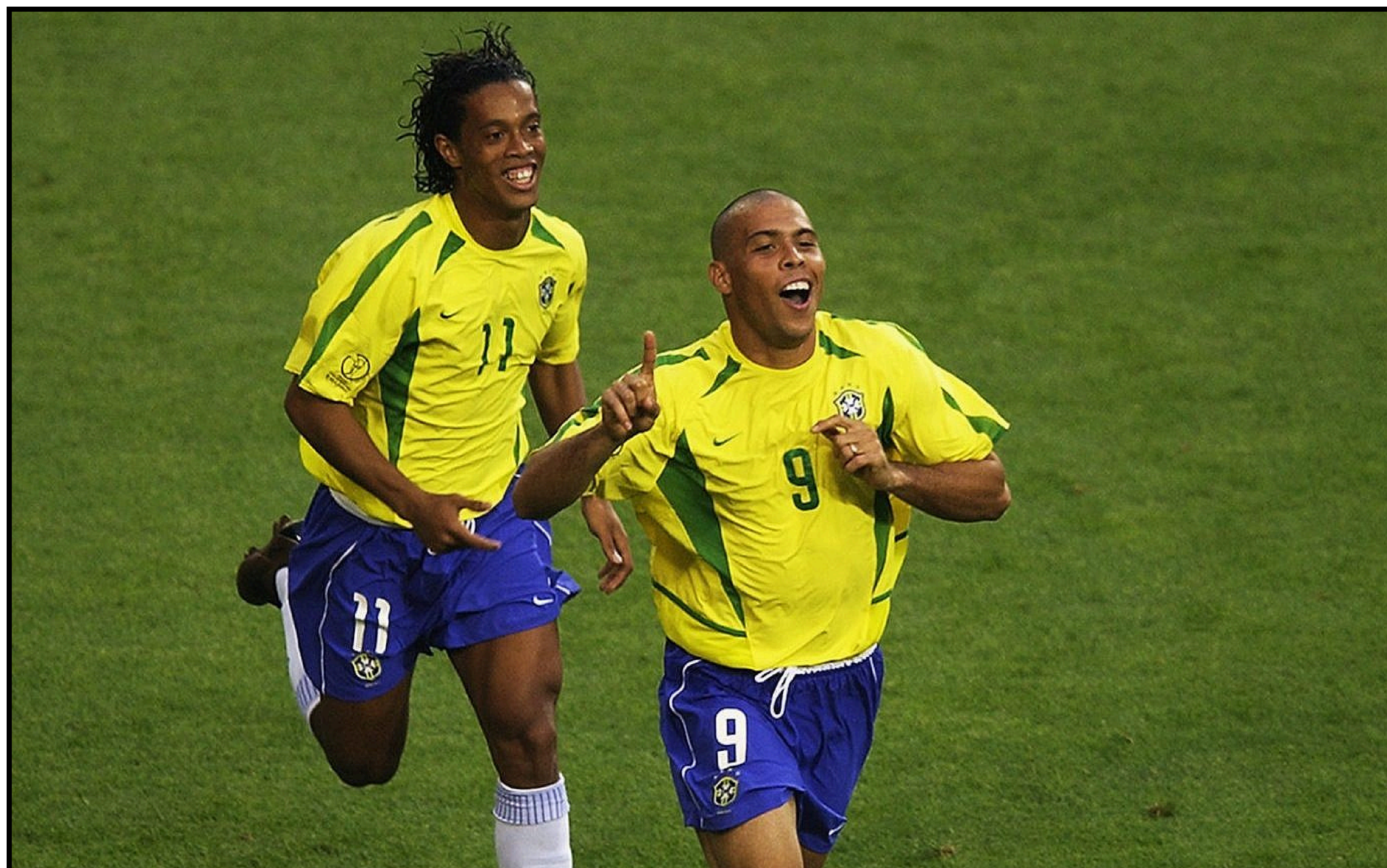
Ronaldo and Ronaldinho Gaúcho