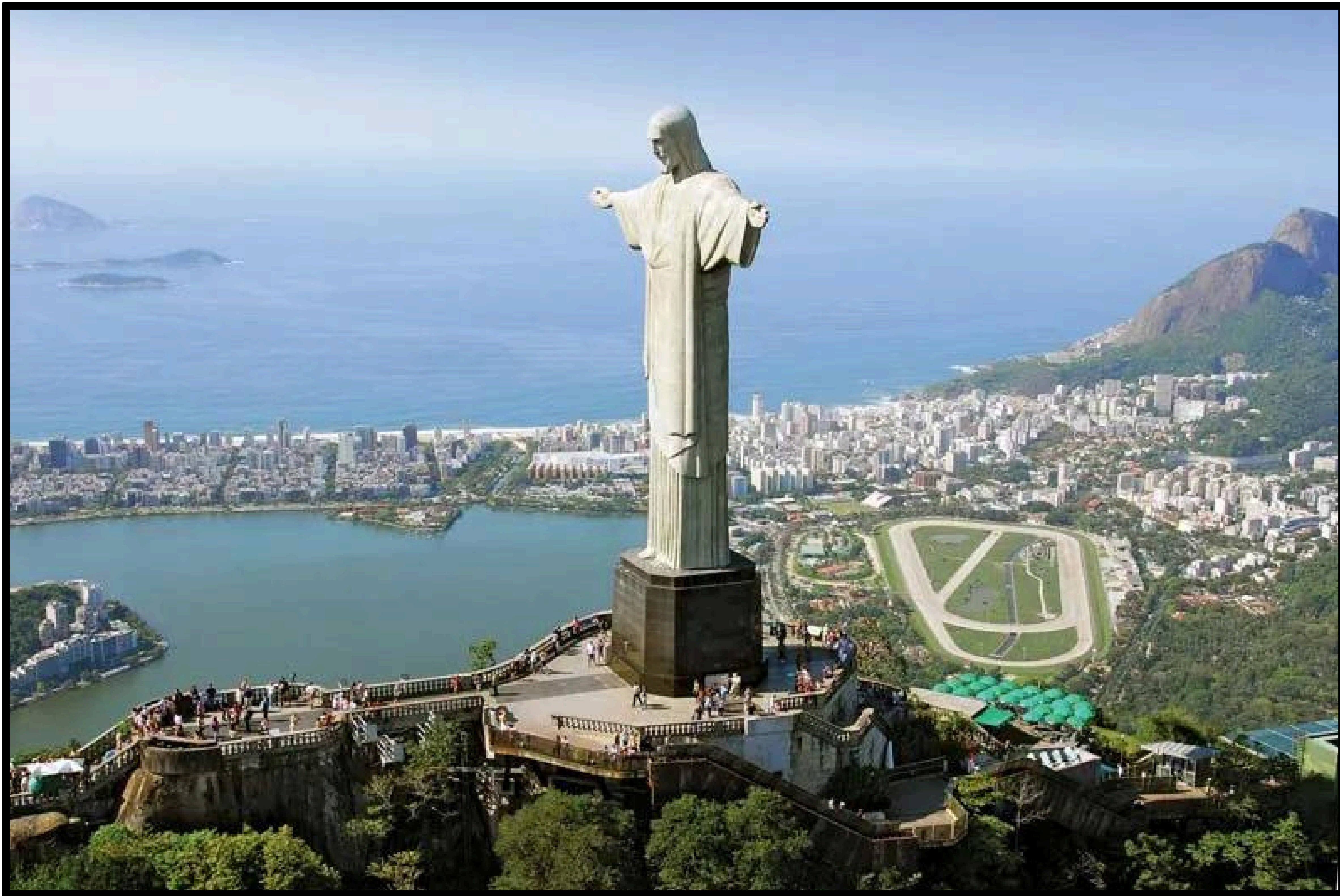
Christ, The Redeemer