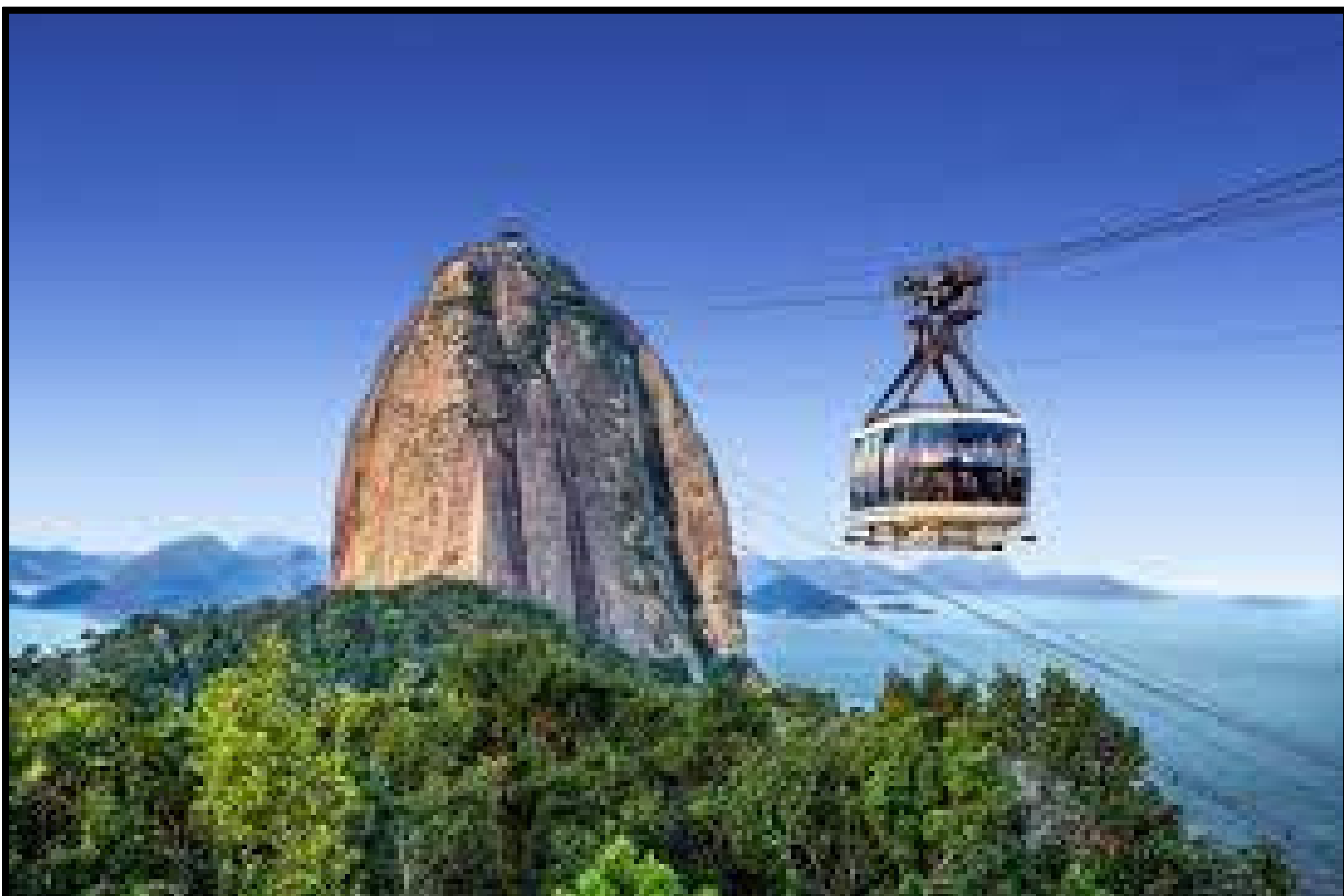
Sugar Loaf Mountain